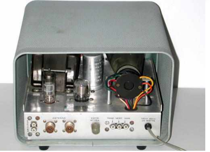
Figure 3: Heathkit SB-610 Station Monitor Scope - Rear view.

-1,400V cathode voltage. A second filament winding powers the remaining tube filaments.