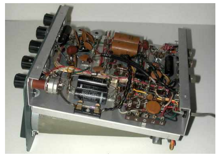
Figure 4: Heathkit SB-610 Station Monitor Scope - Bottom view.

The HO-10 is similar except its tone outputs are 1.0 kc and 1.7 kc. Also instead of using different P.E.C. modules for the two frequencies it uses the same module and the 1.7 kc oscillator