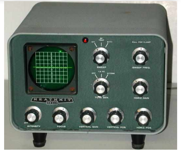
Figure 1: Heathkit SB-610 Station Monitor Scope

However in 1966 when Heathkit released the upgraded twins to the SB-301/401 they also started to add a bunch of station accessories. They released the SB-600 Speaker, the SB-610 Station Monitor Scope and the SB-620 "Scanalyzer" Panadapter; all introduced during 1966. The SB-610 replaced the older HO-10 and the SB-620 (yet to be covered in Heath of the month) replaced the HO-13. It is interesting that the SB-300 never had a matching speaker until the SB-600 came out in 1966!