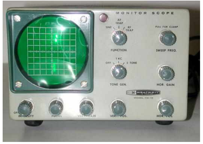
Figure 2: Earlier Heathkit HO-10 Station Monitor Scope

The HO-10 uses six tubes including the CRT. The negative 1,500 high voltage for the CRT is